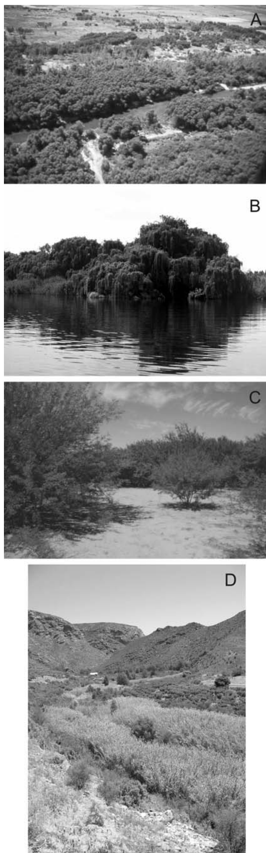
Fig. 3. Examples of alien plant invasions in riparian zones in South Africa: A , dense invasion by Acacia mearnsii along a foothill section of the Riviersonderend River in the winter to all-year rainfall area; B , Salix babylonica invasion along the Vaal River in the summer rainfall area; C , dense Prosopis species invasion along a watercourse in the arid interior; D , dense invasion by the alien reed Arundo donax along the Huis River in the arid interior.

Within the flood-prone width of the river, dense alien stands increase flow resistance, dampen turbulence and aid sediment deposition. 5,14 Changes to channel shape may then follow, with the type of change related to the particular geomorphological reach in which the invasion occurs. In some cases, usually in lowland rivers, channels deepen and banks steepen. 4 In less entrenched foothill rivers, alien trees have a damming effect on flow, leading to a widening of the watercourse and the conversion of well-defined rivers into diffuse systems of shallow channels. 5,14 Once the flood waters subside, these channels may be further colonized by alien plants. 109 Isolated alien trees or groups of trees in the channel form obstructions that increase flow vortices around them and may cause local scour of river banks during floods. 14 A risk associated with the development of higher depositional banks under aliens is that rooting depth is less likely to extend below the failure plane of the bank, resulting in more frequent bank slumping. 14,110 In headwater streams, invasion by alien trees may increase the amount of woody debris entering the stream, causing debris dams that potentially may lead to local channel widening. 14 This effect would likely have the highest impact on aquatic ecosystems when short riparian