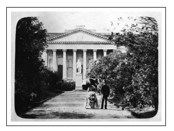
Figure 1. South African public library (circa 1871), NLSA.

While the South African Public Library was playing a role in the Cape Colony, similar developments were unfolding in the Transvaal where the Staats-Bibliotheek der Zuid-Afrikaansche Republiek (the State Library of the South African Republic) was created with a donation of books from the Maatschappij der Nederlandsche Letterkunde. The Staats-Bibliotheek