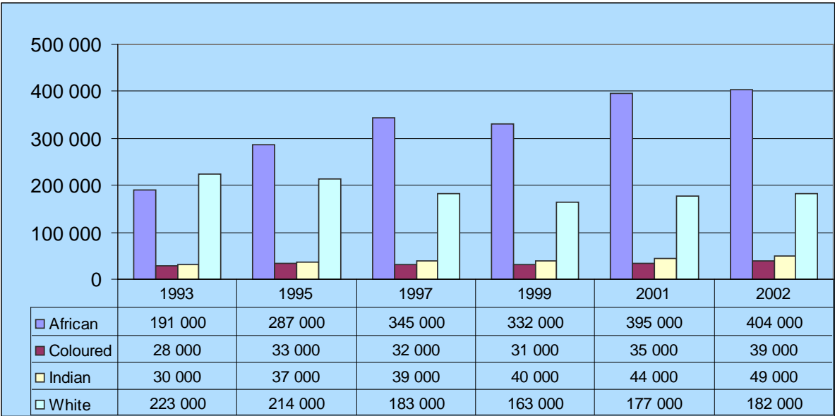
Figure 1: Headcount Enrolments by 'Race', 1993 – 2002

The figures below reflect the changes that have occurred since 1993.